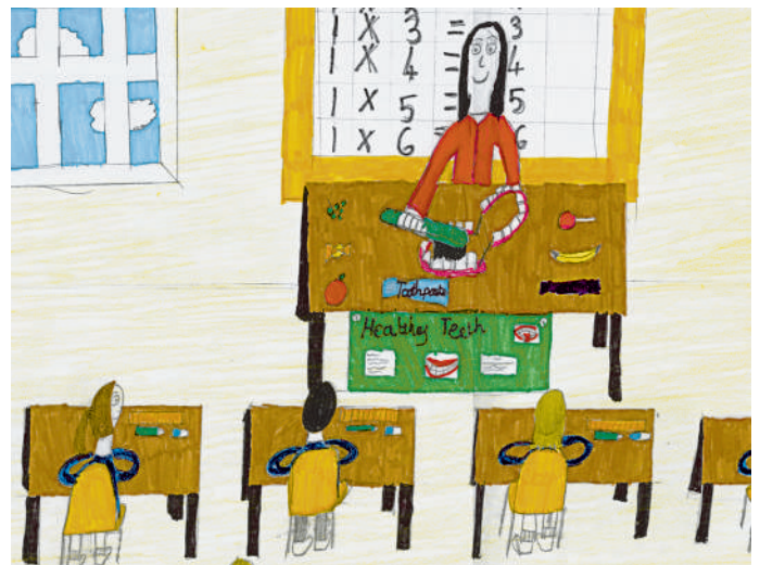
A child's drawing of an Oral Health Educator at work.

In addition to treatment, this service places a significant emphasis on prevention of disease. A team of Oral Health Educators are employed to provide a service to each of the Community Health Partnership localities.