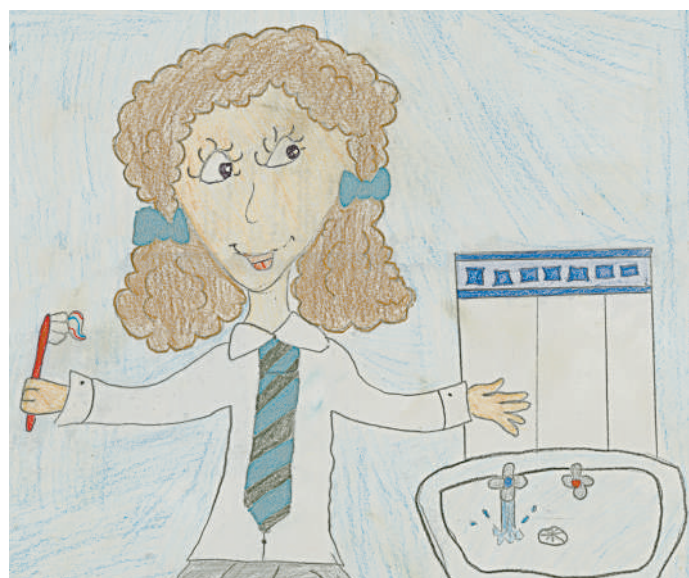
Molly from Molly and the Magic Lunchbox DVD