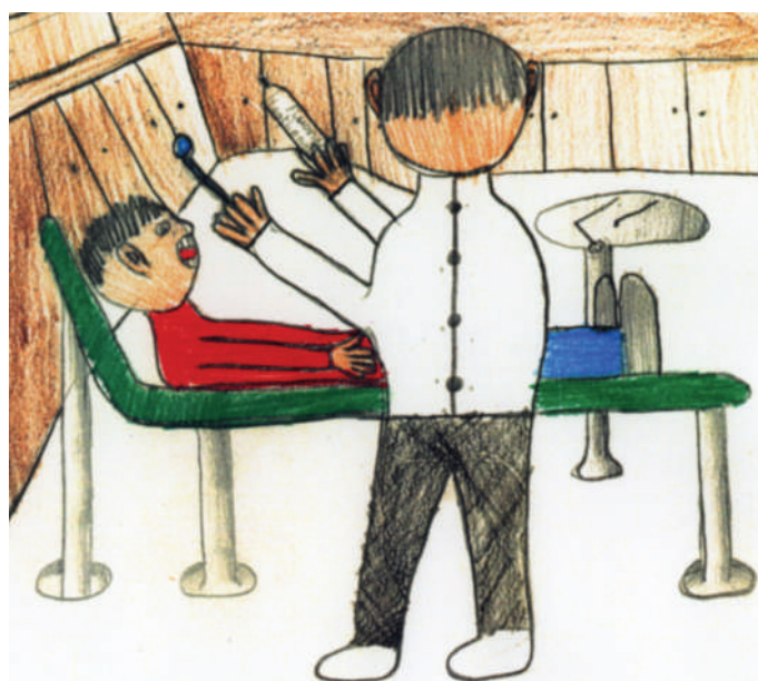
A child's picture of the dentist from 'Harry at the Zoo'.