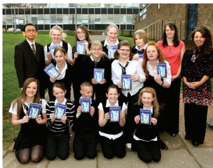
Pupils from Larkhall Academy who scripted and dramatised a story on oral health for their peers.