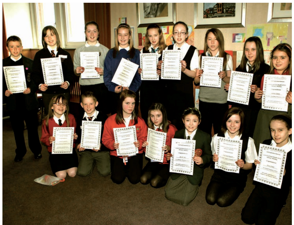
The prize-winning pupils with their certificates.

Lanarkshire pupils won prizes for their schools for doing artwork for the 'Harry's Holiday' DVD, which is a sequel to the award-winning 'Harry at the Zoo' DVD. This second DVD oral health improvement resource was launched on 5 March 2009 at the North Lanarkshire Council headquarters at a ceremony where all the winning schools were invited. 'Harry's Holiday' is another animated film which emphasises the importance of oral hygiene and brushing your teeth correctly.