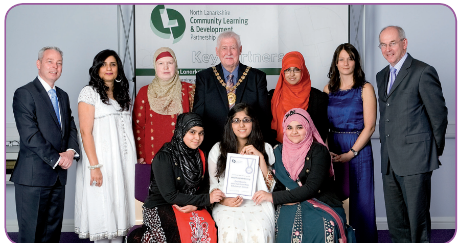
Volunteers secured an award for spreading oral health messages among the Muslim community

Since February 2012, the group has delivered oral health and nutrition messages informally throughout their community