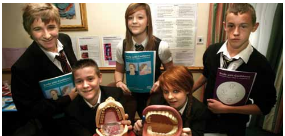
Pupils who were featured in the DVD are seen here with various components of the 'Smile with Confidence' resource.

A new resource entitled 'Smile with Confidence' to promote good oral health amongst secondary school pupils was launched at an event in Bellshill in October 2009. The resource, including a DVD featuring pupils from some secondary schools in Lanarkshire, aimed to help pupils learn more about oral hygiene and tooth decay prevention as well as to change the school environment in terms of oral health and nutrition. A pilot was carried out with nine schools earlier in the year with positive feedback from both pupils and teachers. Copies of this resource were distributed to all secondary schools in North and South Lanarkshire to be incorporated in the school curriculum. Special needs establishments were also given a Makaton DVD, having a method of communication using signs and symbols. This innovative project has won the 2009 Patron's Prize awarded by the National Oral Health Promotion Group.