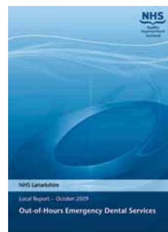
QIS report on Lanarkshire OOH EDS

It is worth noting that following the transfer of the Dental Triage Service (DTS) to NHS24, as a result of changes to payments and terms and conditions, a small number of dental nurses decided to stop participating in the DTS.