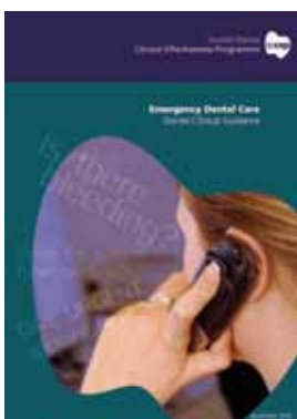
SDCEP Emergency Dental Care guidance

Following the publication of out-of-hours emergency dental care standards by the Scottish Dental Clinical Effectiveness Programme (SDCEP) in November 2007 ( http://www.sdcep.org.uk/index.aspx?o=2542 ), a number of peer review visits were conducted at NHS boards throughout Scotland. In January 2009 a peer review visit took place at NHS Lanarkshire by a review team sent from NHS Quality Improvement Scotland (NHS QIS). The QIS report rated the performance of the OOH EDS against the three standards for out-of-hours emergency dental care set by SDCEP. Some criteria for follow-up were identified.