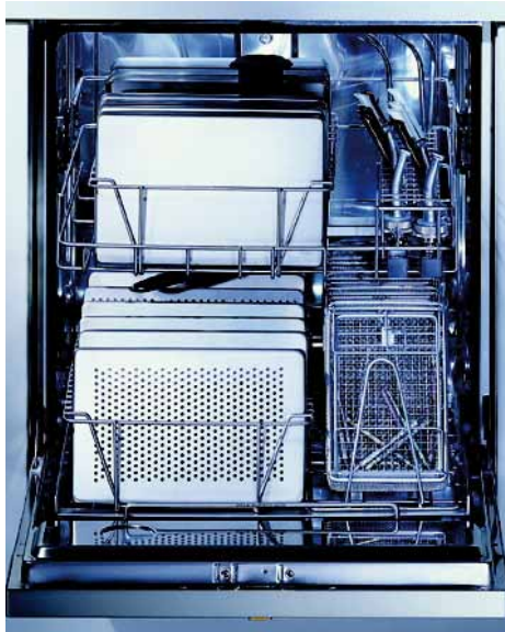
An example of a washer-disinfector.

The hottest topic in dental circles over the last few years has been decontamination; in particular the drive to comply with Glennie technical requirements by having a local decontamination unit (LDU) in every dental practice, taking cleaning and sterilising of dental instruments out of clinical areas. It has been a difficult time for dental practices to keep up to speed with the changing goalposts: vacuum or non-vacuum sterilisers; which ultrasonic cleaners; washer-disinfectors – now or later, can a decontamination room be set up in the existing premises?