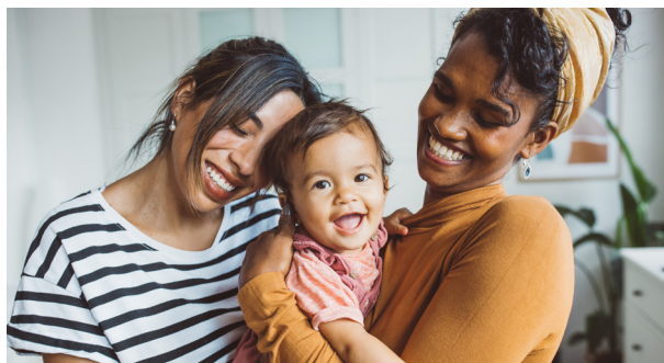
2 Infant Minds Matter

The mental health of a baby affects their mental health in childhood, adolescence and adulthood. This means a baby's mental health is not just important now, but also for their future.