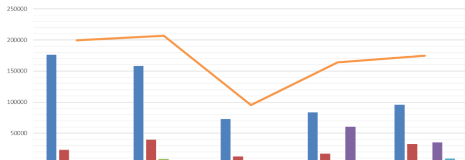
Condom Distribution Totals

There are 115 C Card Centres, based within Health Centres/Pharmacies, where anyone who lives, works or studies in Lanarkshire can access free condoms. The Just Ask Service has grown to 90 members, with 16 new services recruited this year, including services supporting young people, refugees and people experiencing homelessness.