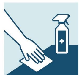
Keep objects and surfaces clean

Call your doctor again if you are getting worse. Call back if you are having trouble breathing. Do what your doctor says.