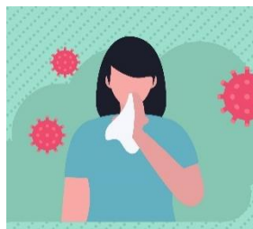
Use tissues, then throw them away