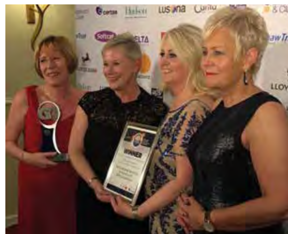
Continence team celebrates excellence in procurement