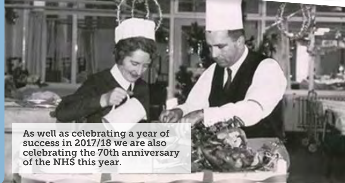
As well as celebrating a year of success in 2017/18 we are also celebrating the 70th anniversary of the NHS this year.