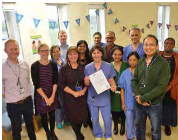
UK top 10 for training for obstetrics & gynaecology