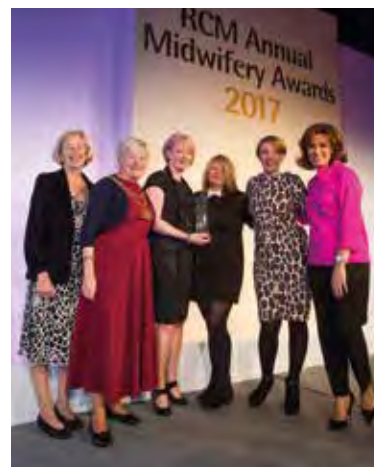
RCM Midwifery Service of the Year