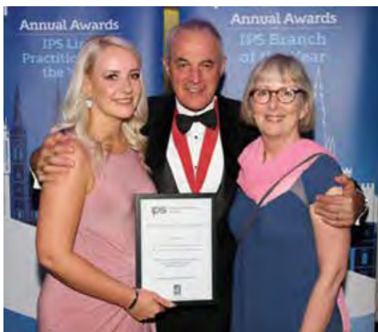
The IPC team's poster was best in 2017

NHS Lanarkshire is proud to have celebrated a number of key achievements throughout 2017/18. Staff play a vital role in delivering high quality safe, effective and person-centred healthcare services. Each achievement illustrates NHS Lanarkshire's strong commitment to providing patients with the best possible standards of care.